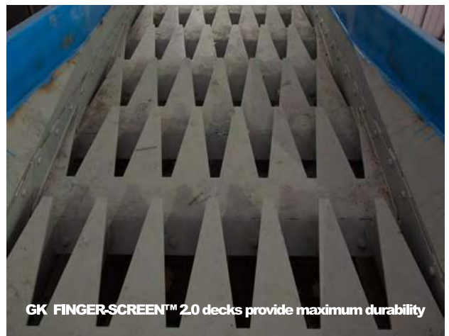
GK FINGER-SCREEN™ 2.0 decks provide maximum durability

Vibratory motion evenly spreads material for maximum classification efficiency and each unit is custom designed to meet your specific classification requirements.